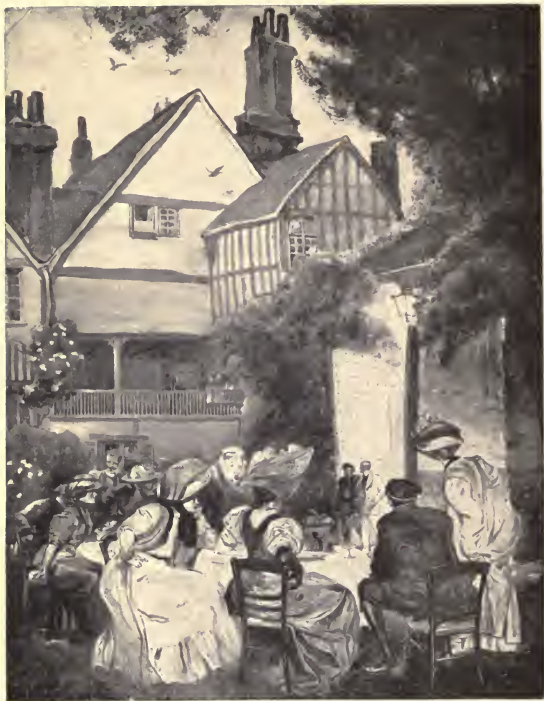
Several pairs of brighter eyes followed my companion